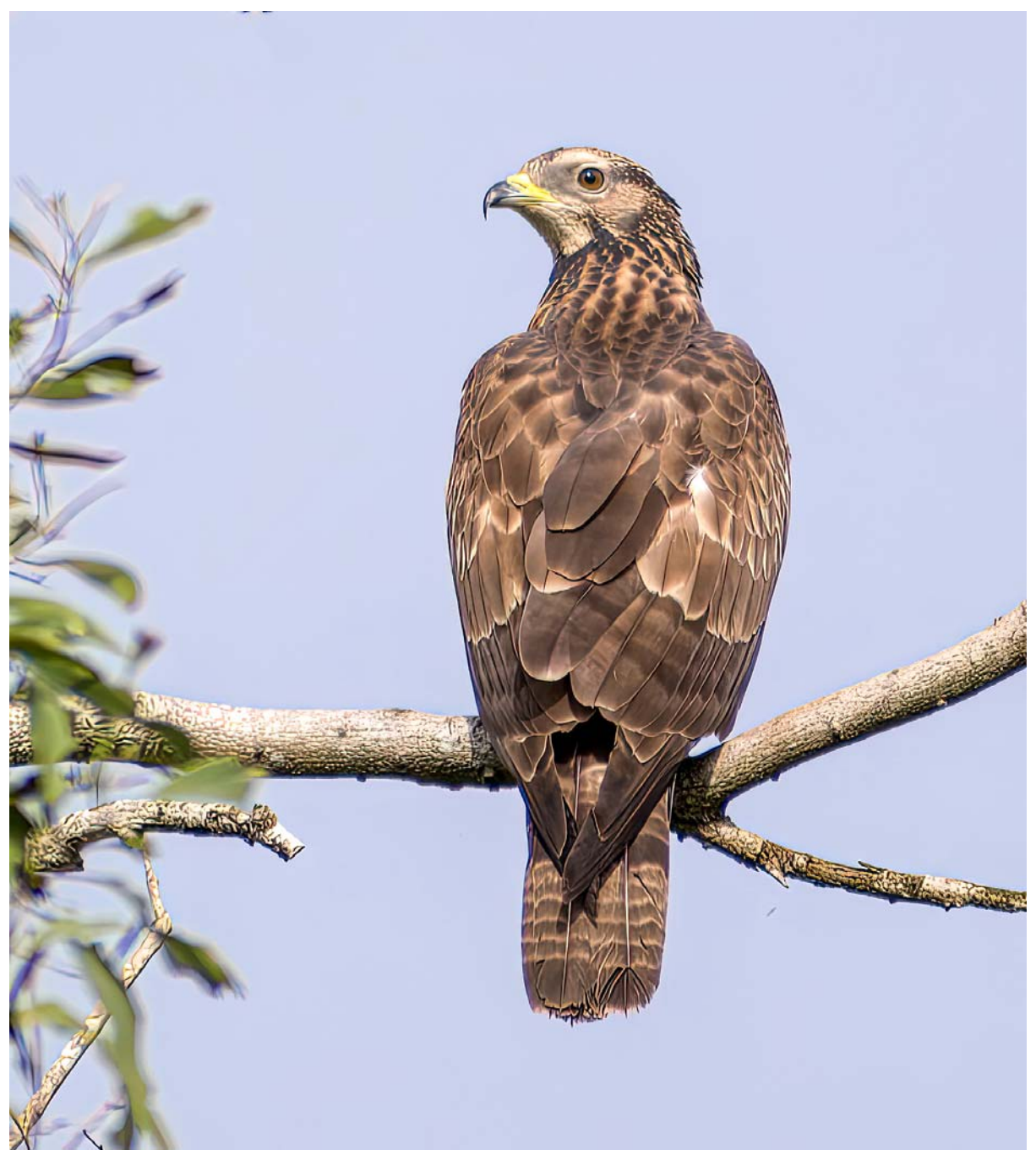
Oriental Honey Buzzard, juvenile (yellow cere & brown eyes), at Pasir Ris Park, Feb 2023