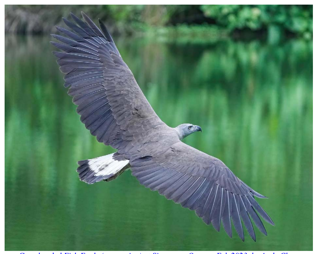
Grey-headed Fish Eagle (upperwing) at Singapore Quarry, Feb 2023, by Andy Chew

There were two records of the Oriental Scops Owl Otus sunia : one at Windsor Nature Park on 4 Feb found injured and rescued; and one at Mandai Track 15 on 26 Feb. There were also four Ospreys Pandion haliaetus ; seven Japanese Sparrowhawks Accipiter gularis ; seven Peregrine Falcons Falco peregrinus ; 20 Black Bazas Aviceda leuphotes ; and 62 Oriental Honey Buzzards Pernis ptilorhyncus .